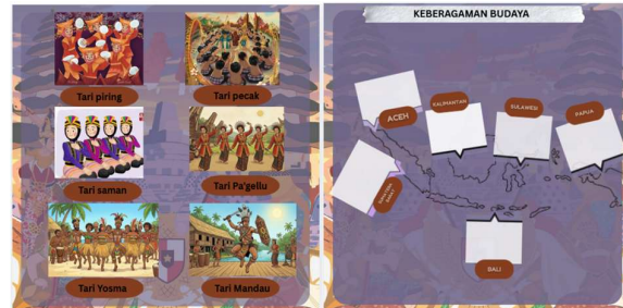
Figure 4 Activity 3 "Cultural Diversity"

Figure 4 shows the "Cultural Diversity" activity, where students place pictures or names of traditional dances onto the Indonesian map according to their regions of origin.