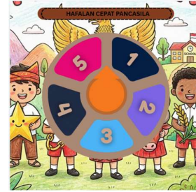
Figure 2 Activity 1 "Quick Memorization"

Figure 2 shows the "Quick Memorization" activity, where students spin a number wheel representing the sequence of the five principles of Pancasila and mention the corresponding principle based on the selected number.