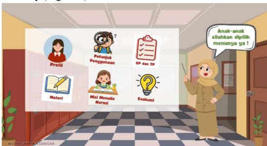
Figure 2 Main Menu Display

The main menu functioned as the central navigation interface, providing access to usage instructions, learning materials, narrative writing missions, and evaluation sections. The navigation system was designed to be simple and systematic to enable students to access each section independently and efficiently (Figure 2).