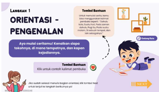
Figure 8 Imagination Studio Display (Writing Stage)

During the revising and editing stages, the Story Detective Post feature functioned as a checklist to help students review the completeness of content, story structure, and language accuracy in their written narrative texts (Figure 9).