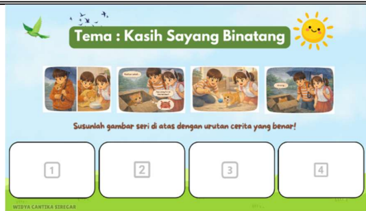
Figure 6 Picture Series Display (Result of Story Creation Machine)

The Word Bank feature provided vocabulary support to assist students in selecting appropriate words and constructing sentences more easily during the writing process (Figure 7). Furthermore, the Imagination Studio feature guided students in organizing narrative text structures consisting of orientation, complication, resolution, and coda (Figure 8).