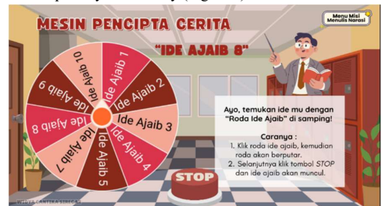
Figure 5 Story Creation Machine Display (Pre-Writing Stage)

The Story Creation Machine feature functioned during the pre-writing stage to help students generate story ideas through rotating themes and picture sequences (Figure 5). The resulting picture sequences served as visual stimuli for students to develop narrative plots systematically (Figure 6).