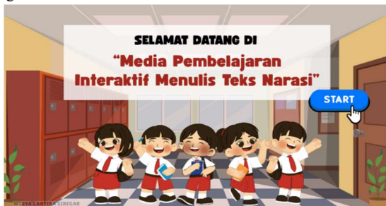
Figure 1 Opening Page Display

The opening page (cover) displayed the title of the learning media, learning identity, and a navigation button leading to the main menu. This interface was designed using attractive color combinations and illustrations to increase students' attention and motivation at the beginning of the learning process, as shown in Figure 1.