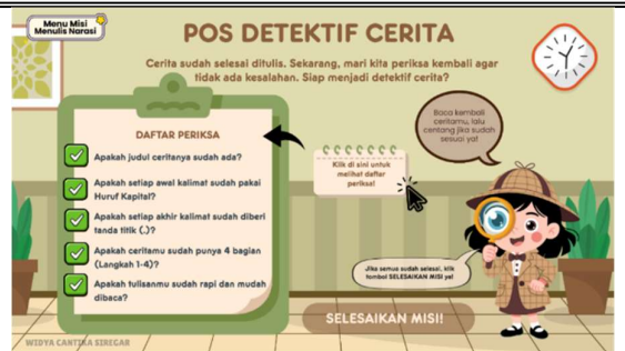
Figure 9 Story Detective Post Display (Revising and Editing Stage)

During the revising and editing stages, the Story Detective Post feature functioned as a checklist to help students review the completeness of content, story structure, and language accuracy in their written narrative texts (Figure 9).