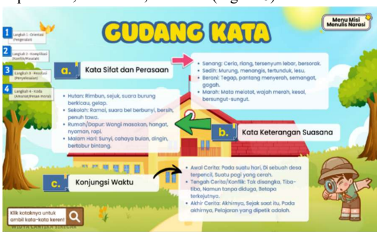
Figure 7 Word Bank Display (Vocabulary Development)

The Word Bank feature provided vocabulary support to assist students in selecting appropriate words and constructing sentences more easily during the writing process (Figure 7). Furthermore, the Imagination Studio feature guided students in organizing narrative text structures consisting of orientation, complication, resolution, and coda (Figure 8).