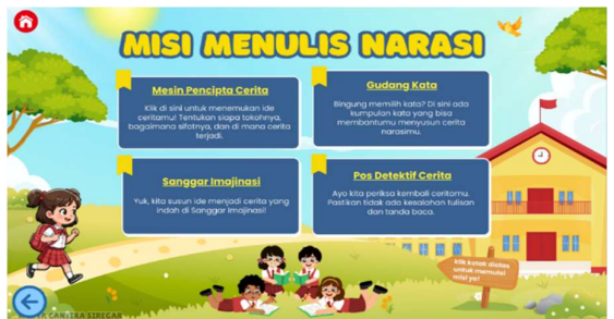
Figure 4 Narrative Writing Mission Menu Display

In the narrative writing mission menu, the media were equipped with four main interactive features, namely Story Creation Machine, Word Bank, Imagination Studio, and Story Detective Post (Figure 4). These features were designed to support each stage of the narrative writing process in a gradual and structured manner.