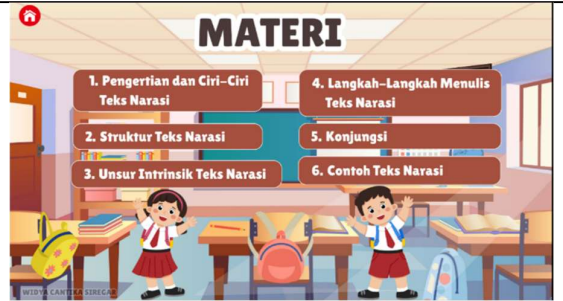
Figure 3 Learning Material Menu Display

The learning material menu contained instructional content related to narrative text writing, including the definition, characteristics, structure, elements, conjunctions, and examples of narrative texts. The materials were presented using simple language supported by illustrations and visual elements to facilitate students' understanding of the concepts (Figure 3).